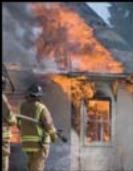
Flood • Fire • Windstorm

Shouldn't you have an Adjuster working for you?